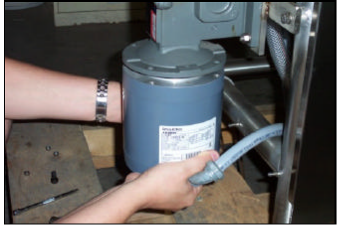
Removing the drive motor.